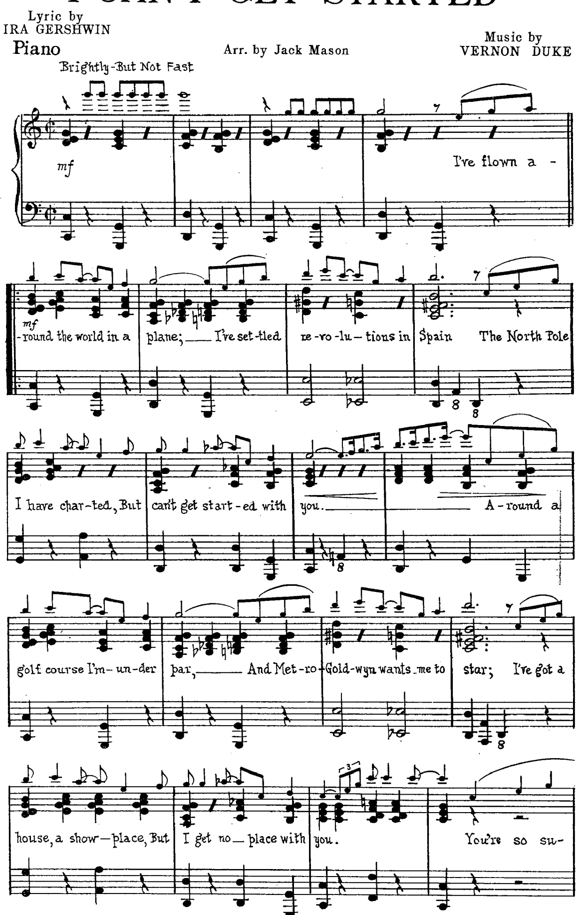
Copyright MCMXXXVI by Chappell & Co., Inc. International Copyright Secured Made in U.S.A.