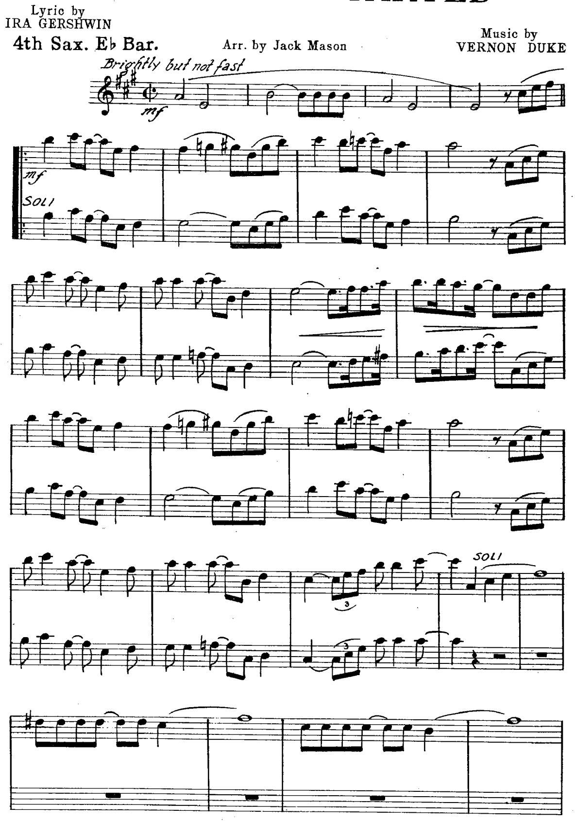
Copyright MCMXXXVI by Chappell & Co., Inc. International Copyright Secured Made in U.S.A.